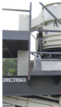
Gated overflow chute