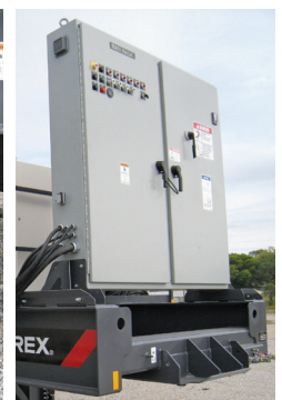
Optional control panel