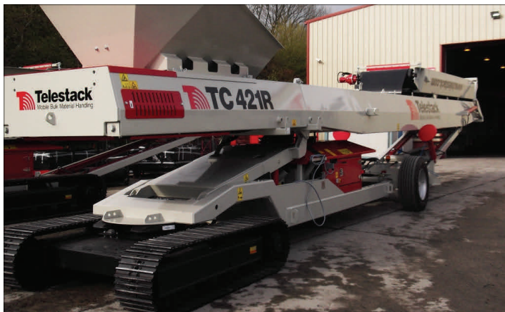
1.8 metre (6ft) crawler track mounted unit