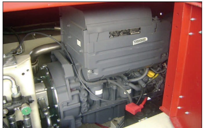
Diesel hydraulic engine (Optional Dual Power)