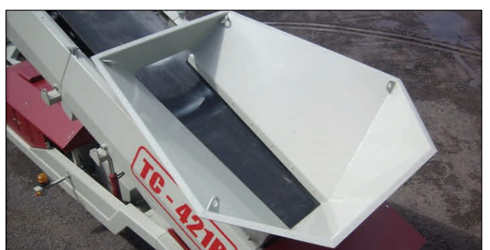
Hexagonal feed-boot - 2.39m x 2.22m (7'9" x 7'3")