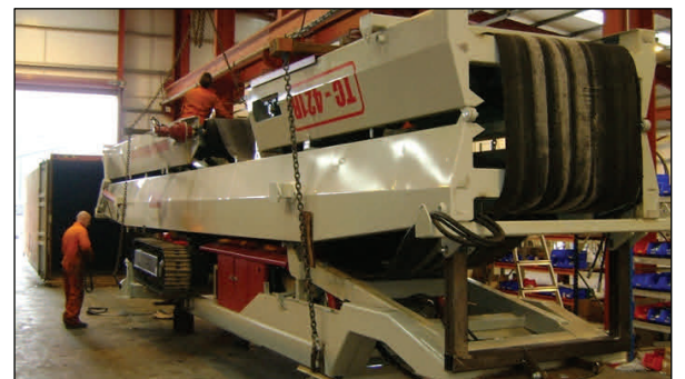
Packed into 1 x 40ft 'HC' Container