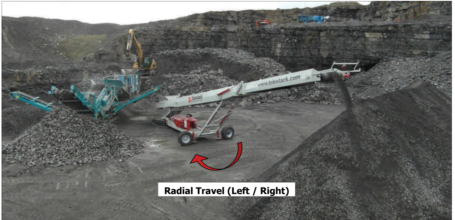
Radial Travel (Left / Right)