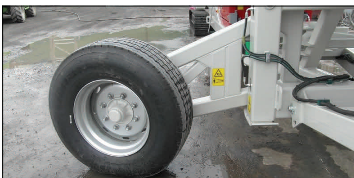
Internal hydraulic radial wheel drive (Radial movement)