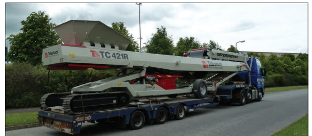
Transport Mode - 1 x Low Loader (RO -