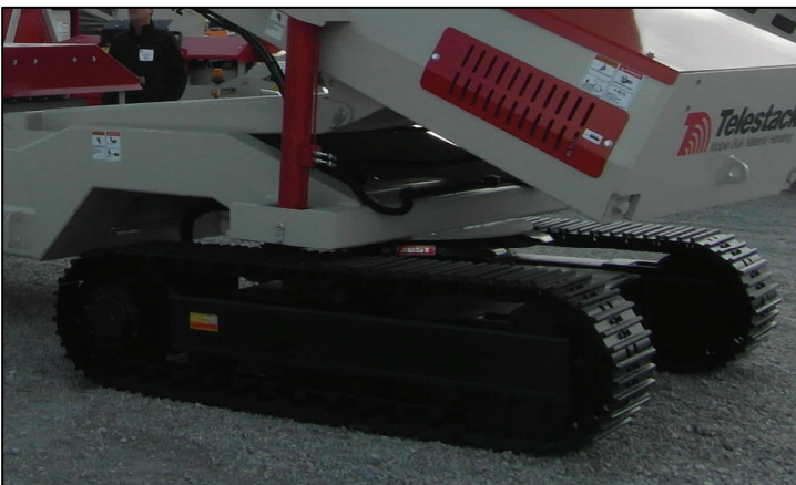
1.8 metre (6ft) crawler track mounted unit