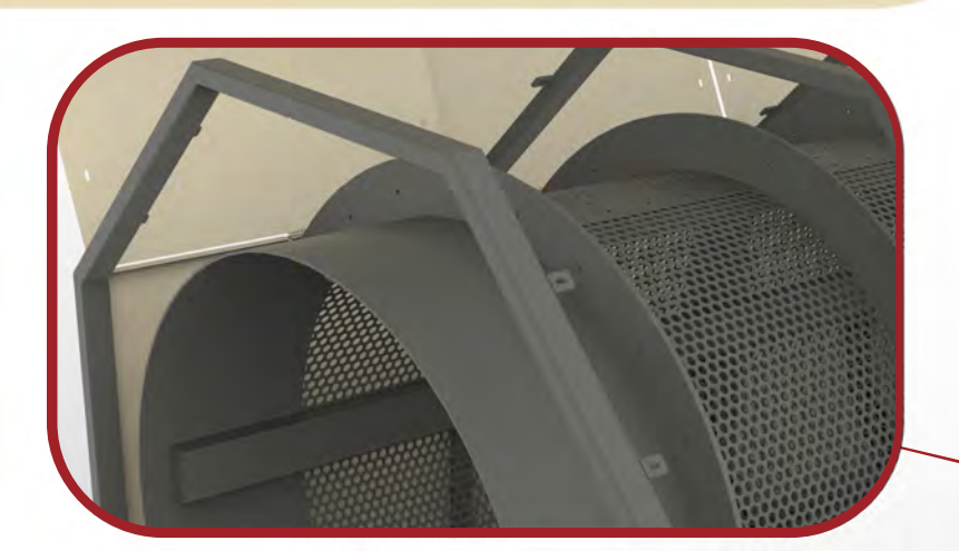
VARIOUS SCREEN OPENINGS

The M520R trommel is used for light recycling materials, compost, wood bark etc. Its screens can be changed easily and the screen aperture can be from 5 mm to 50 mm (0.2" to 2"). Driven by twin 3 kW (4 HP) electric motors, the drive is powerful and smooth. It comes fully guarded and CE certified.